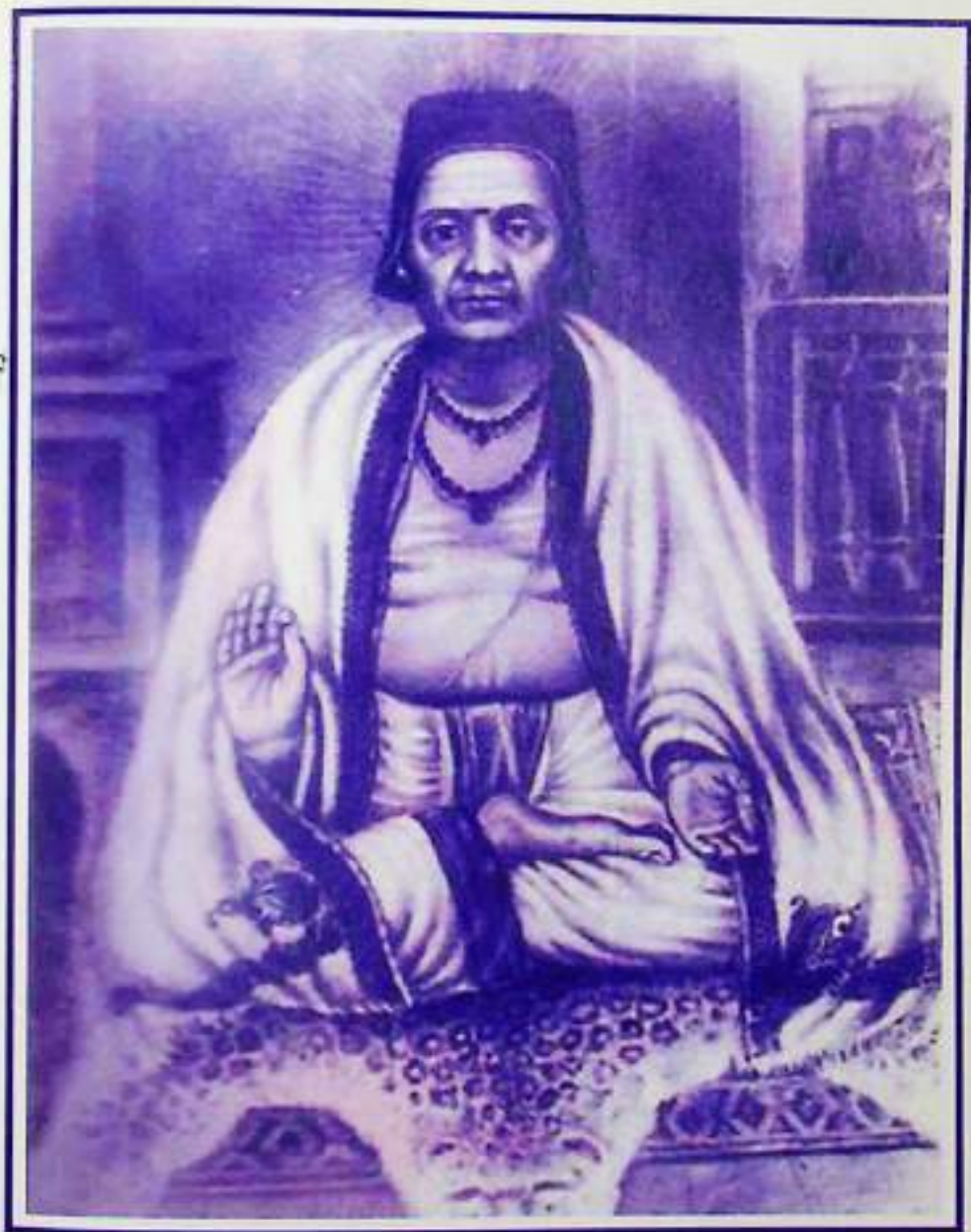
SREE BHASKARA RAYAR