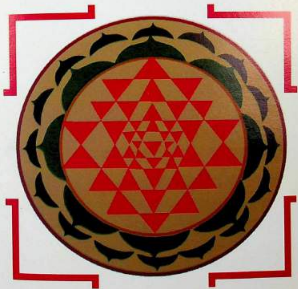
Meru Sree Chakra