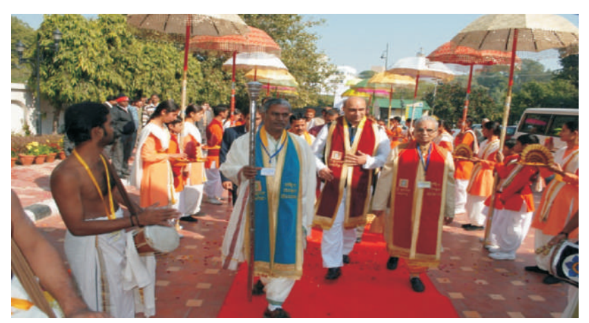
Glimpses of the Ceremony - Hon'ble Minister of H.R.D., Govt. of India in between

On 21st January, 2013, 4th convocation ceremony of Rashtriya Sanskrit Sansthan, New Delhi was held in Sirifort Auditorium, New Delhi. Hon'ble Dr. M.M. Pallam Raju, Union Minister for HRD and Chancellor of Rashtriya Sansrit Sansthan, New Delhi was the chairperson of this function. Former Justice of