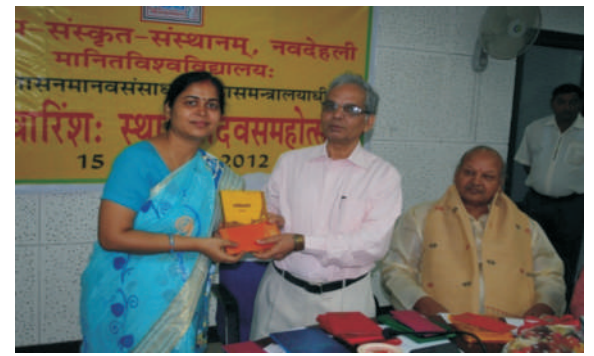
Prize Distribution in Hindi Competitions