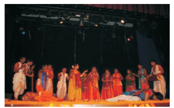
Bhopal Campus, Prabuddharohineya