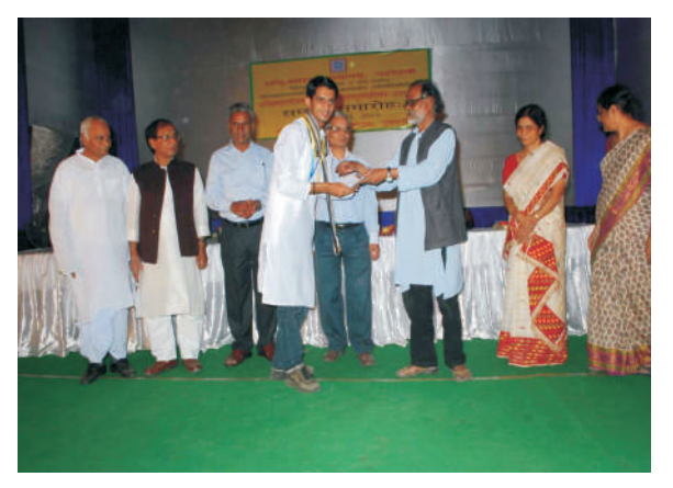
Giving away prizes to the winners on the occasion of Inter Sanskrit Universities Youth Festival organised at Guwahati

On the basis of results of sports and cultural competetions, the Rashtriya Sanskrit Sansthan was declared as the overall winner.