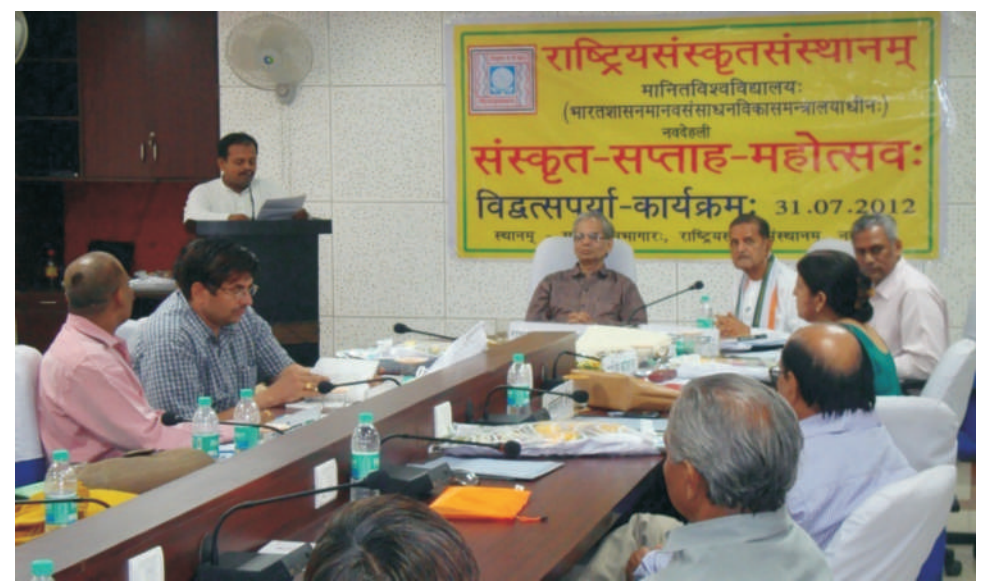
Vidvat Saparya Programme

The Sanskrit competitions were organized for school level Boys and Girls w.e.f. 01.08.2012 to 03.08.2012. During competitions Boys and Girls of 112 schools from Delhi and NCR encouragingly took part in Stotrapath, Speech and Essay competition.