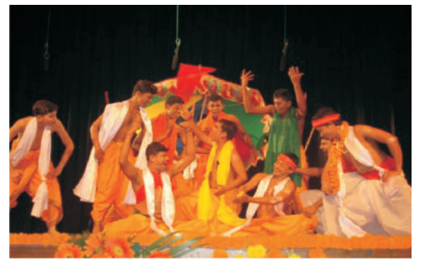
Puri Campus, Mallikamakranda Prakaranam