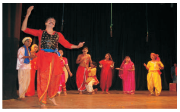
Lucknow Campus, Mricchakatikam (9-10 Canto)