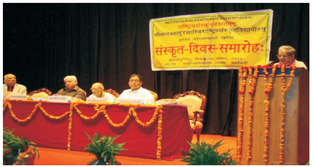
Sanskrit Divas Celebration

In this function, scholars who are of the field other than Sanskrit but have made special contributions for Sanskrit were honoured with Sanskrit Sevavrati honour alongwith a one time prize money of Rs. One Lakh. The names of honoured scholars are as under -