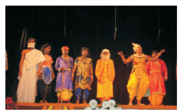
Allahabad Campus, Mudritmudachandraprakaranam

In this three days Mahotsava, Boys/Girls students studying in 10 constituent campuses of Sansthan staged following dramas :