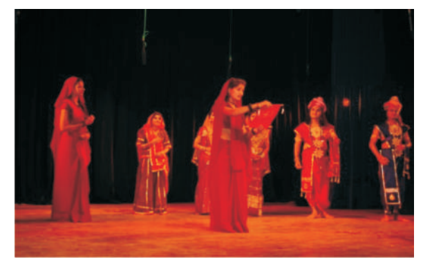
Jaipur Campus, Malatimadhava