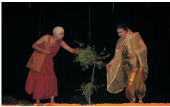
Jammu Campus, Mricchakatikam (8 Canto)