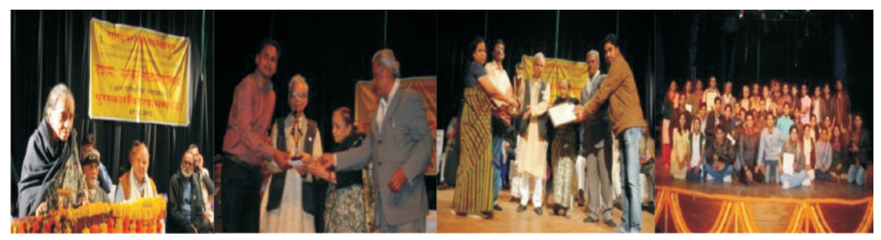
Valedictory and Prize Distribution Function

All Successful participants were encouraged with cash prizes, moments certificates