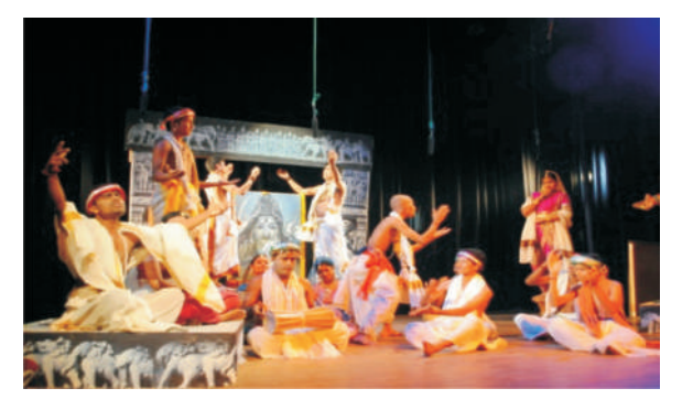
Guruvayoor Campus, Mricchakatikam (3-5 Canto)