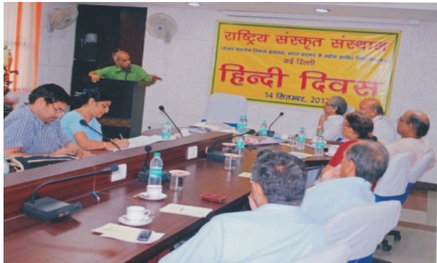
Inaugural Function of Hindi Divas