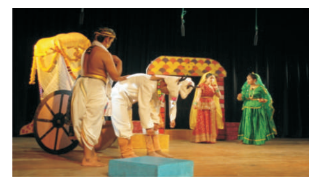
Garli Campus, Mricchakatikam (6-7 Canto)