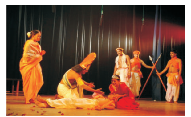
Mumbai Campus, Kaumudimitrananda Prakaranam

Decision of the Judges was as under in inter campus drama competitions:-