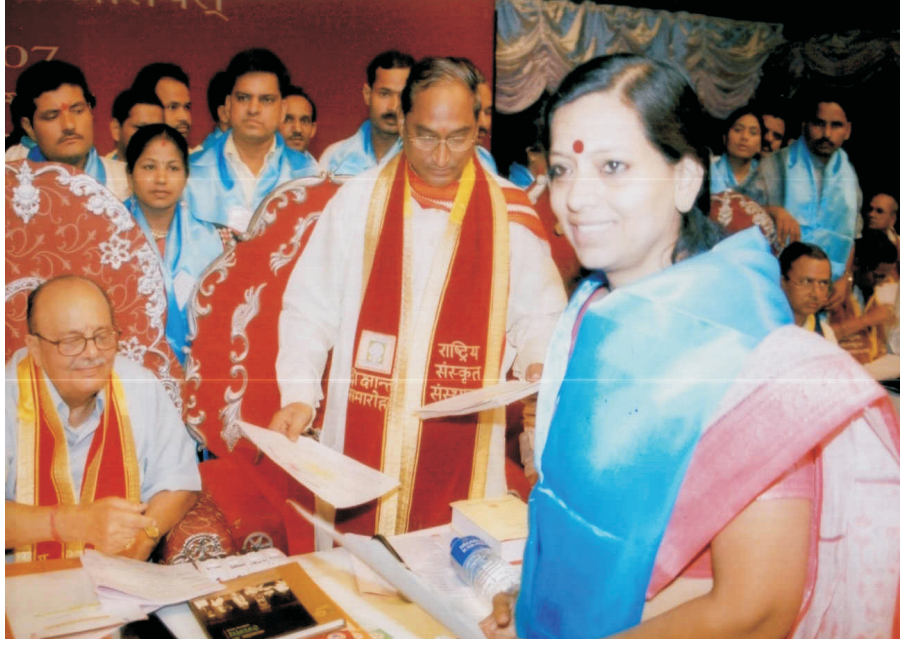
Hon'ble Minister awarding the Degree