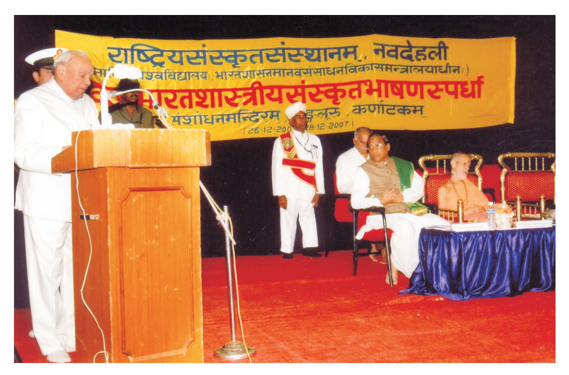
Sh. H.E. Rameshwar Thakur, Hon'ble Governor Karnataka addressing on the occasion of All India Elocution Contest, Bangalore.

Karnataka State stood at top in over all performance. Cultural Programmes were also staged. Besides participants, a large number of Sanskrit scholars, staff, students and general public enjoyed this event with great enthusiasm.